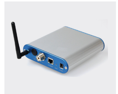
Coloured end panels available upon request